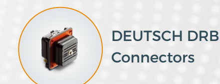
DEUTSCH DRB Connectors