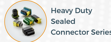
Heavy Duty Sealed Connector Series