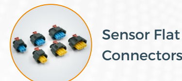
Sensor Flat Connectors