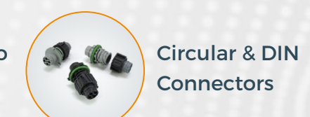
Circular & DIN Connectors