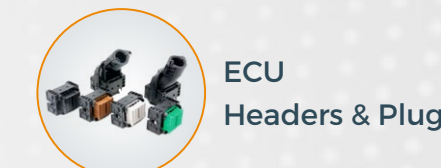
ECU Headers & Plugs