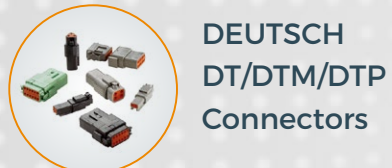
DEUTSCH DT/DTM/DTP Connectors