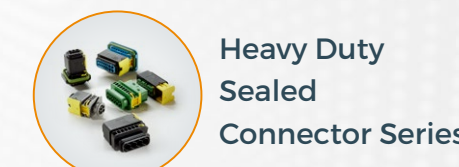
Heavy Duty Sealed Connector Series