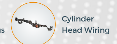
Cylinder Head Wiring