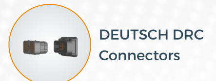
DEUTSCH DRC Connectors