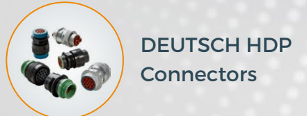
DEUTSCH HDP Connectors