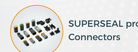
SUPERSEAL pro Connectors