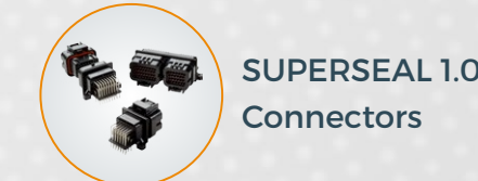
SUPERSEAL 1.0mm Connectors