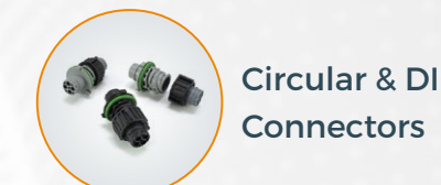
Circular & DIN Connectors