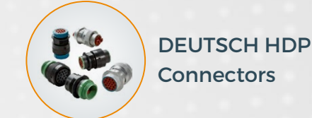
DEUTSCH HDP Connectors