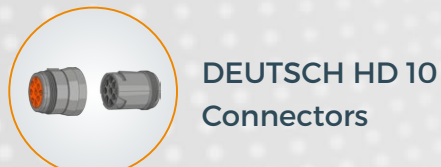
DEUTSCH HD 10 Connectors