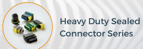
Heavy Duty Sealed Connector Series