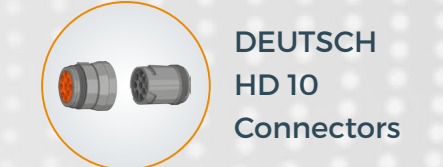
DEUTSCH HD 10 Connectors