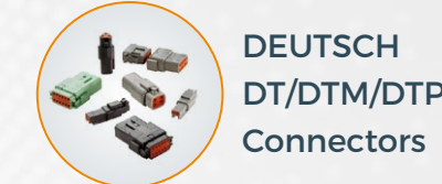
DEUTSCH DT/DTM/DTP Connectors