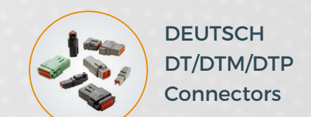
DEUTSCH DT/DTM/DTP Connectors