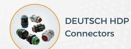
DEUTSCH HDP Connectors