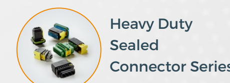
Heavy Duty Sealed Connector Series