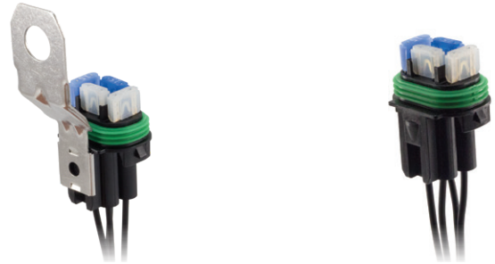
Part number 2066046-2 pictured