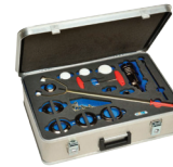
RPIT Installation Tool